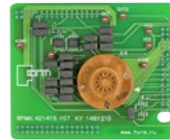
Standard test fixture for testing integrated microcircuits using FORMULA® 2K Test System

TestBox® Test Solutions are delivered both as part of the Test System delivery, and separately, at any time over the equipment life cycle.