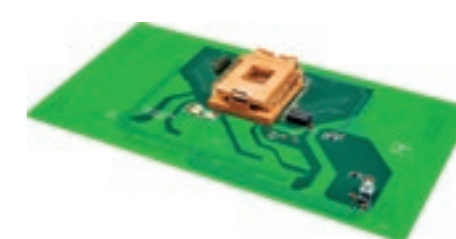
Standard test fixture for testing VLSI circuits using FORMULA® HF3 Test System