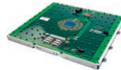
Test fixture for testing Altera STRATIX4 FPGA using FORMULA® HF Ultra Test System