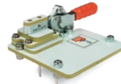
Standard test fixture for testing semiconductor devices using FORMULA® TT2 Test System