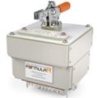
Standard test fixture for testing electromagnetic relays using FORMULA® R Test Systems